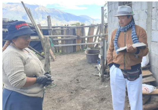
Segundo sharing the Word in a nearby village