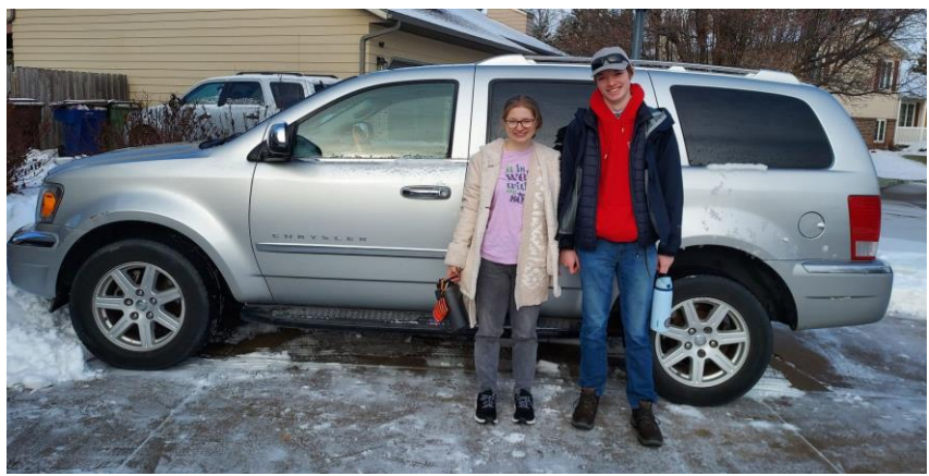
Our kids' new (to them) vehicle

Since our car accident on Thanksgiving where the kids' college car was totaled, we have spent a lot of time vehicle shopping. Thank the Lord, he provided a really good vehicle in early January, just in time for them to return to classes. When we return to Quito in June, we will be car shopping there, also. So I just thought I'd note some differences in vehicle shopping between the two countries.