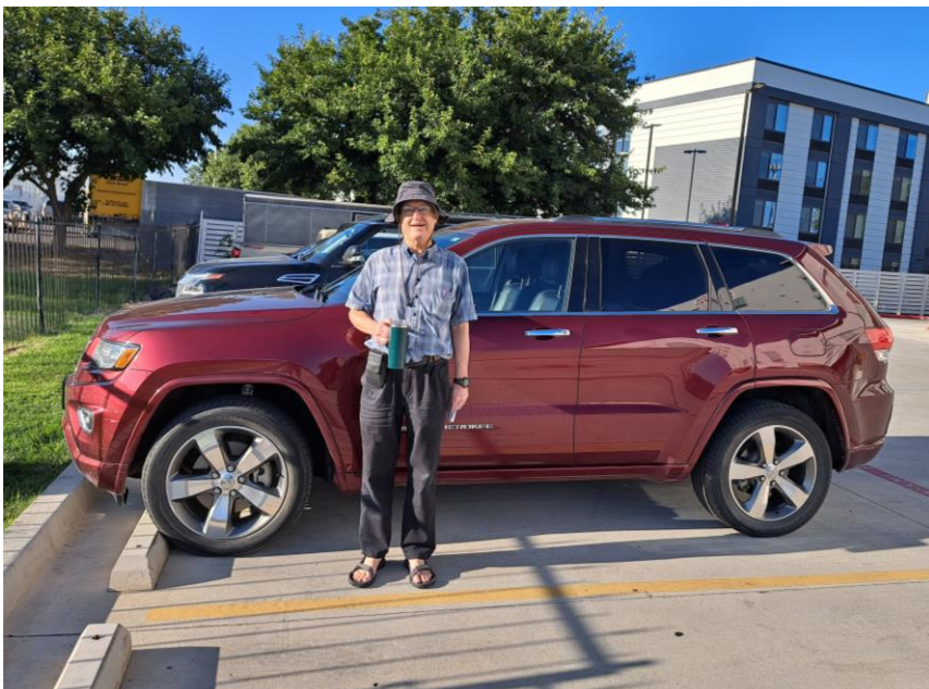
We thank God for his provision of a car for us to drive to visit all of you this year, and for a home base in Kearney, Nebraska.