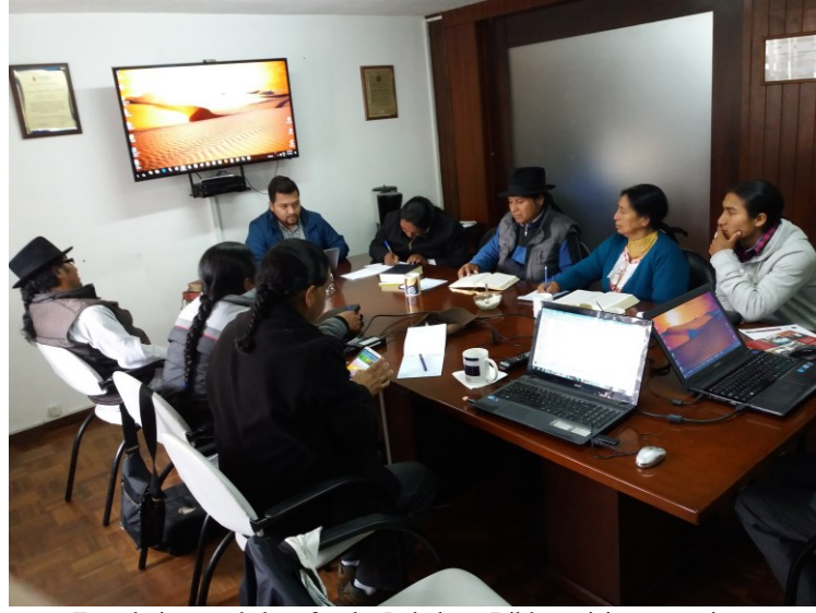
Translation workshop for the Imbabura Bible revision committee

Well, as it turns out that director is no longer there, and the international organization has decided that a "fairly quick revision" is not the best plan. Instead they have authorized a complete and proper revision of this