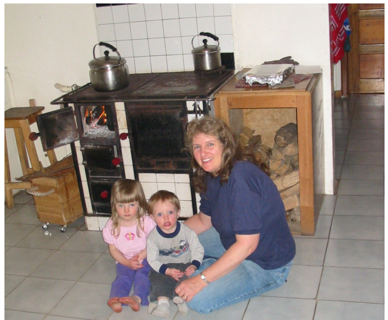
In the kitchen

it going. One thing that helped was that I (Rick) had learned to use a wood-burning stove in Jungle Camp in