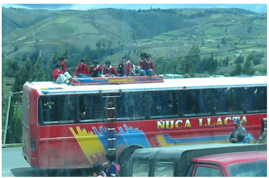
Schoolboys (unsupervised) riding on top of a bus.

And we saw some interesting things on top— live animals as large as sheep, and even (to the horror of a mother) quite young children. We wondered how many deaths there are a year!