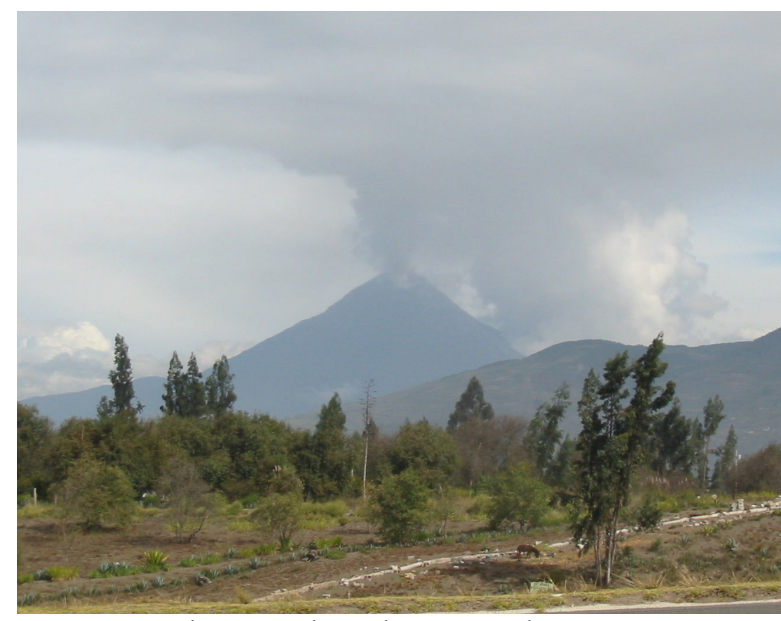
The Tungurahua volcano, as we drove past

When we arrived at the house in Colta, we had to light the fire in the wood-burning stove, so that we would be able to cook supper, and so that we would have hot water for a shower the next morning. (The hot water heater is connected to the stove.) It took us a while to figure out how it all worked, and some phone calls, but we finally got