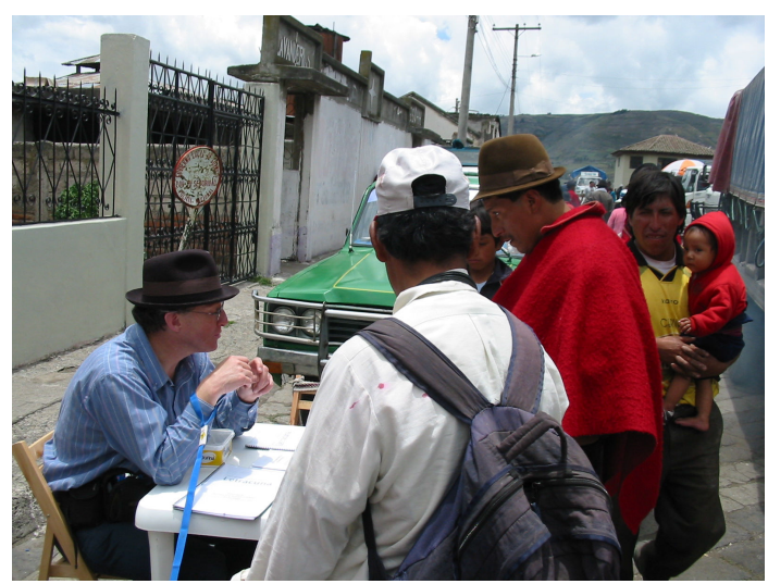
Selling books in Guamote

On several occasions during our selling, people said, "I'm Catholic, so I can't buy your books." I said, "Oh, but these books are for everyone, not just Evangelicals! Even the ones about the Bible are for everyone,