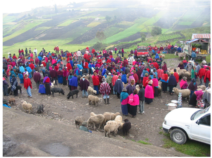
The animal market in Tsalarón