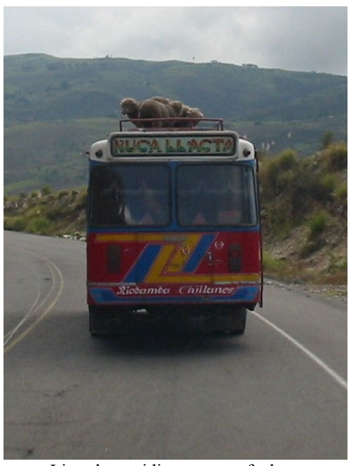
Live sheep riding on top of a bus.