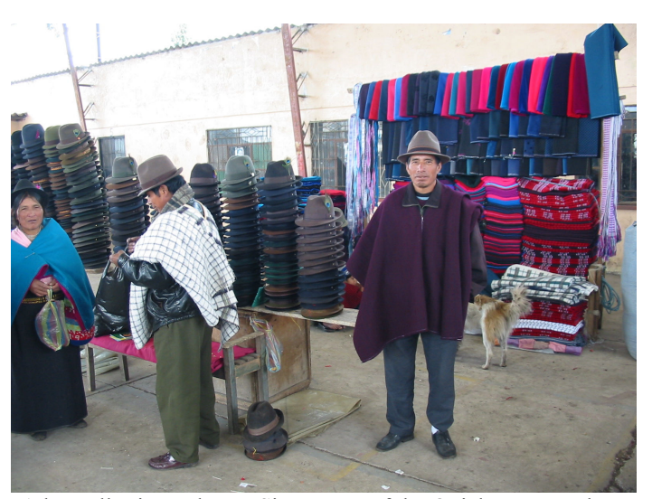
A hat seller in Tsalarón. Since most of the Quichuas wear them every waking moment, indoors and out, this is a major commodity!