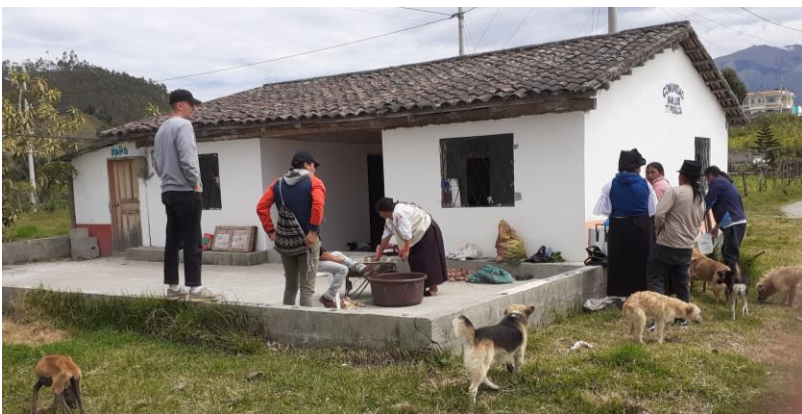
Refurbished community center in use

In addition, God may be opening another door in this area. The Pan de Vida (Bread of Life) ministry helps families build businesses with individual and community loans. They