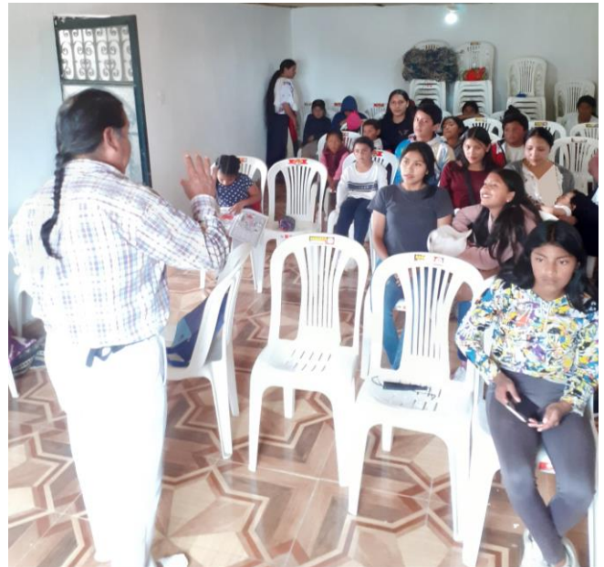
Special celebration in the community center