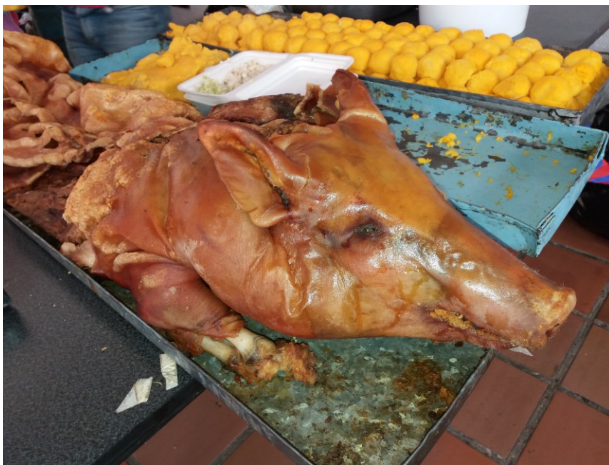
After the Quito Day event we ate traditional hornado , a delicious whole-roasted pig stuffed with rice, including the delectable rind (back left). In the background are balls of tortilla de papa , a kind of spiced mashed potato.

Thanks for your faithful prayers. I am almost completely recovered from my emergency colon surgery in August, and I even got out for a fairly easy mountain climb recently. (Betty says I should say it was 13,800 feet high, but that is by far not the highest around here.) God is good!