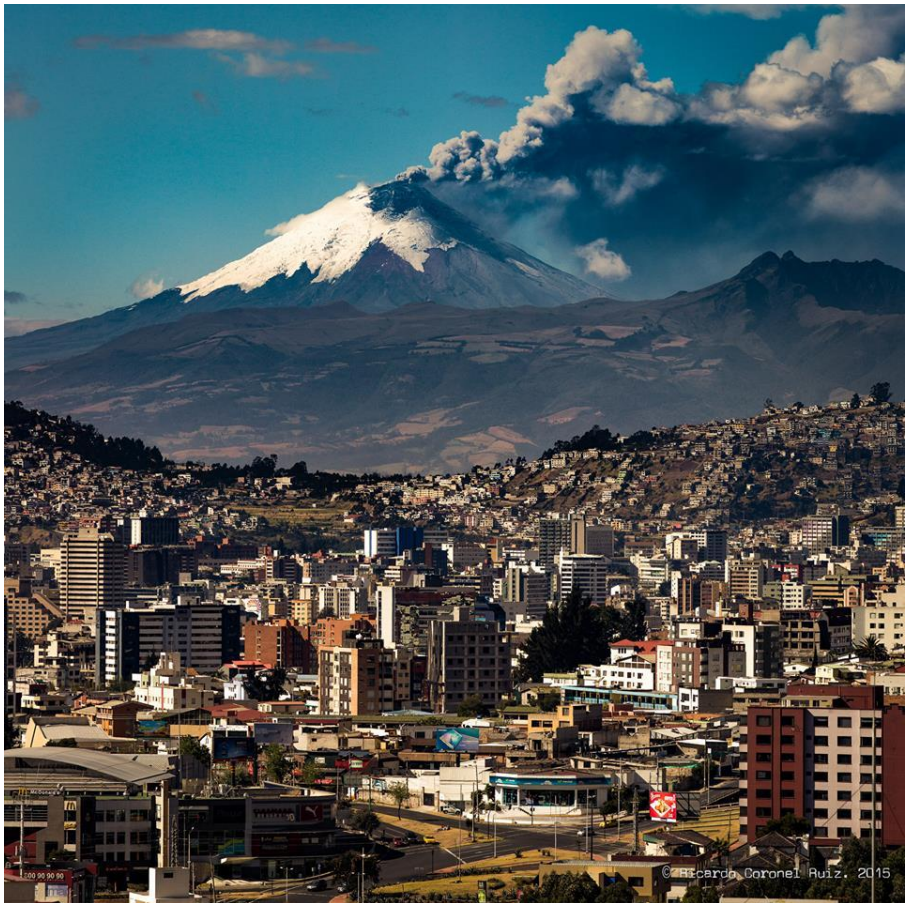
The Cotopaxi volcano erupting with ash and steam on August 22, viewed from close to our house in Quito. The ash has stained the white glacier black, though thankfully very little has melted so far.

Thanks again to so many of you who sent in extra funds over the last few months, and of course also to our faithful regular supporters. At the beginning of August our MTW account had the highest balance it has had for a whole year, which was wonderful, because our international moving bill had to be paid in August!