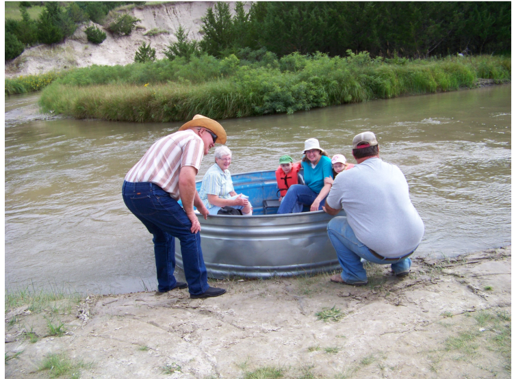
"Tanking" on the Middle Loup River

We are also looking for another dog. We have heard that several dogs in our neighborhood have been poisoned before robberies so we are trying to figure out the best way to keep a dog safe, but still use it as a guard dog. Please pray for us about all this.