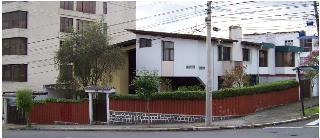
Our house in Quito. It shares a wall with the house on the right.

We think the thieves probably jumped the wall to get in, but they would probably have had to open the carport gate from the inside to get the car parts out. Nearly all the houses have bars on the windows and doors, and many have alarm systems.